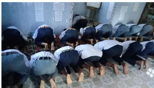
Figure1. Implementation of Students' Congregational Prayer

In addition to the students, teachers and student advisors also accompany them during the activities. The presence of teachers during the activity provides students with a direct example of the importance of discipline and responsibility in performing worship. With daily practice, religious activities become part of the school culture, consistently applied in students' daily lives.